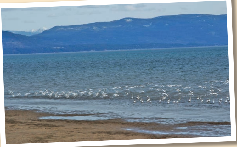
Swans on the North Shore

terfowl migration spectacle from a bird viewing platform, skipping rocks with your grandchildren in the clear blue water on a sandy North Shore beach. This vision brings together land owners, community members and conservation groups to conserve the North Shore's special qualities.