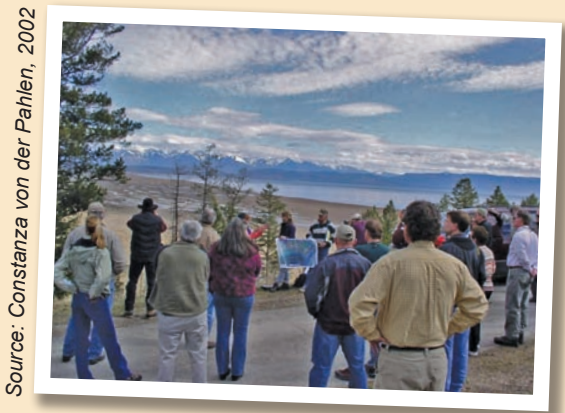
North Shore Field Trip

Imagine future generations enjoying this landscape and knowing that we had the foresight to conserve the North Shore.