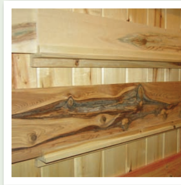
Specialty woods and trim