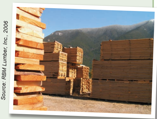
Selected & stacked lumber

entire ecosystem, the Thompson's strive to create the smallest amount of disturbance to any location they work. Their care can be seen in the places they have logged. "We are dedicated to meeting the needs of the company and our customers without compromising the health and stability of the areas in which we work," says Ben. And by milling salvage trees, the company produces wood products with extraordinary variety of character and color.