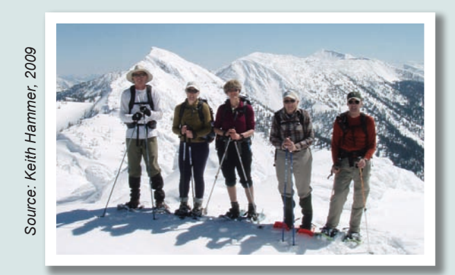
Infinity Ridge - At the top

The group celebrated its 200th outing in October 2009 and has seen all sorts of wildlife on the outings, including grizzly bear, deer, elk, mountain goat, and the tracks of pine marten, lynx, wolverine and more! To learn more about the Swan Rangers, to read some of their weekly reports, or to sign up for their weekly emails, visit the "hiking" page at www.swanrange.org!